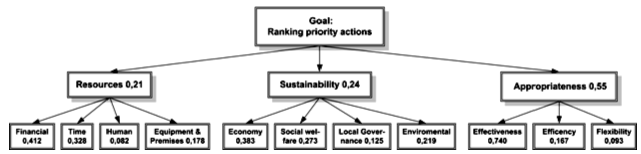
Figure 3. AHP model (hierarchy) of criteria for priority actions.

For the actions' priority ranking, when a simplified model is used, the sub-criteria of criterion resources will be excluded.