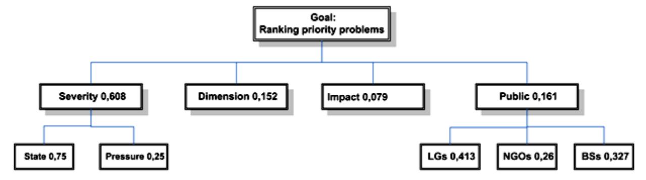
Figure 2. General hierarchical model for determining the priority problems.

The aim of the first AHP model shown in Figure 2 is to rank priority problems in the specific municipality for which the local government will develop a strategic plan according to the LA21 process.